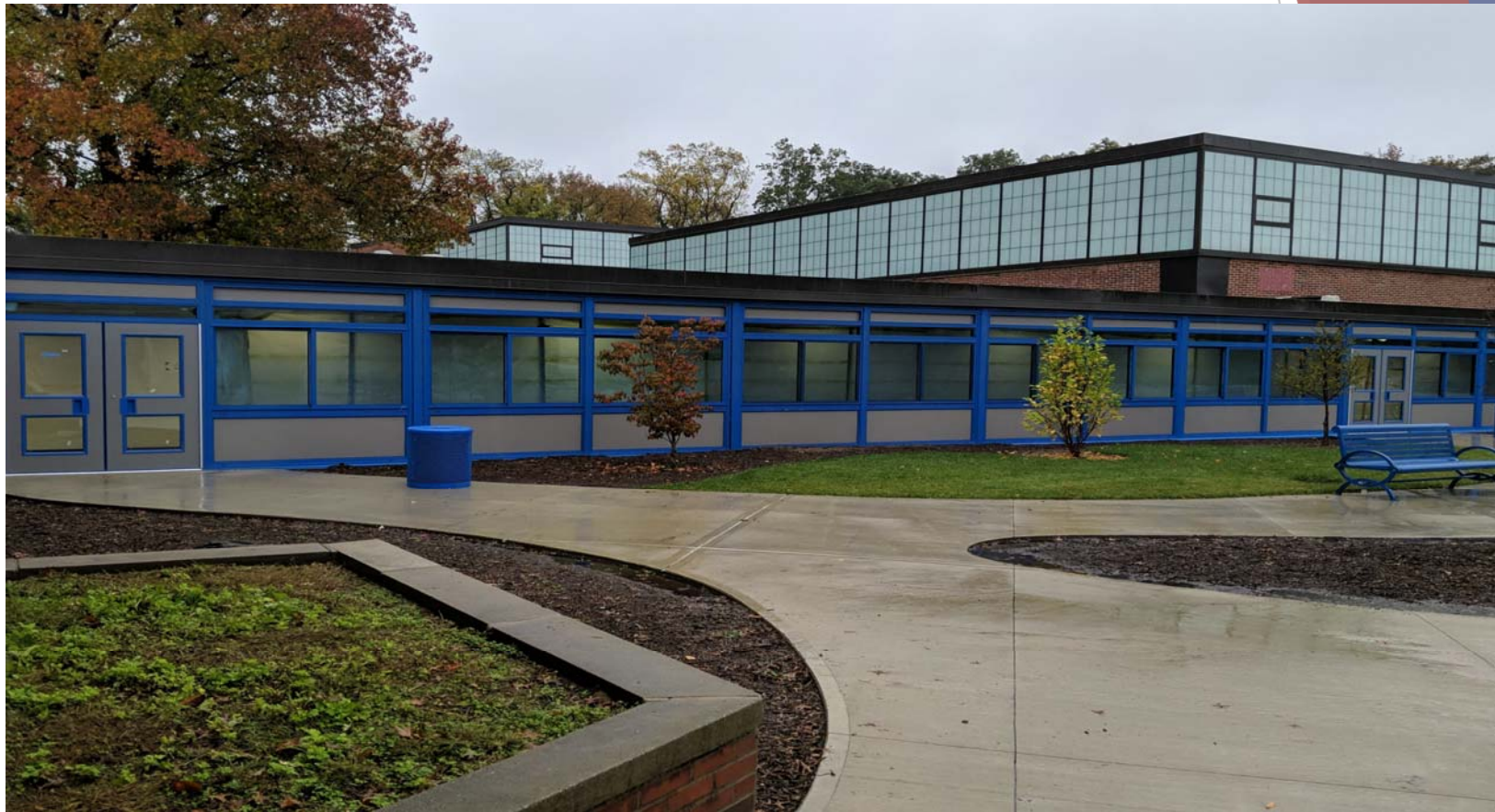
Courtyard Window Replacement